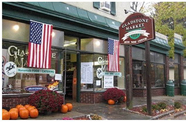
Close to Shops & Restaurants