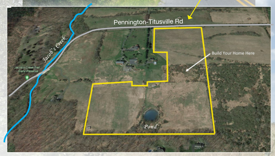
358 Pennington-Titusville Rd, Hopewell Township, Mercer County, NJ 08525

Online Bidding Concludes Thursday, October 26, 2023 at 11 am