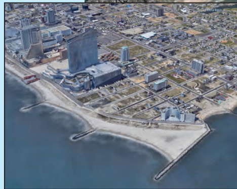
20 Beach Block Lots in the SE Inlet