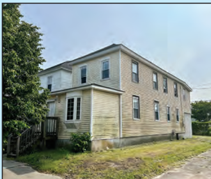
Bungalow Park Bungalow