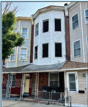
3 Story Home on Pennsylvania Ave