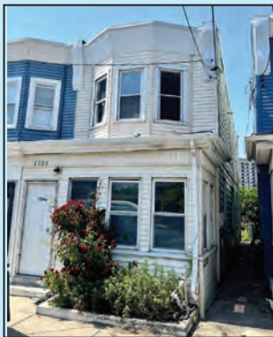
1109 Adriatic Ave