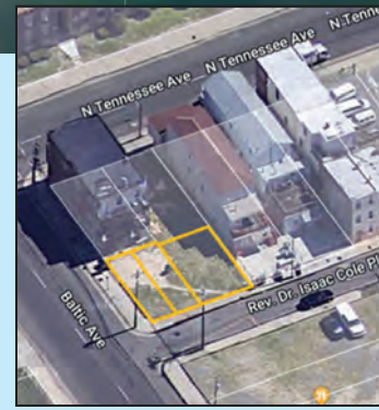
3 Lot Assemblage