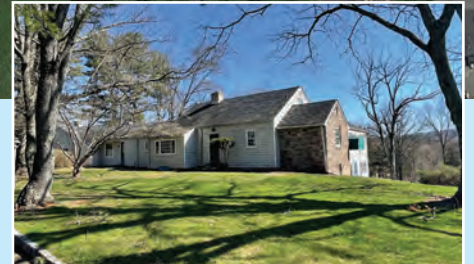
1132 Route 31 4,464 ± SF-Multi Tenant Configuration