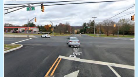
Signalized Intersection Route 31 & Payne Road