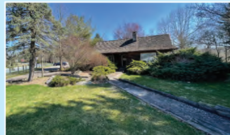
1136 Route 31 3,950 ± SF - On Signalized Intersection