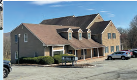
1128 Route 31 16,000 ± SF - 7 Tenant Spaces