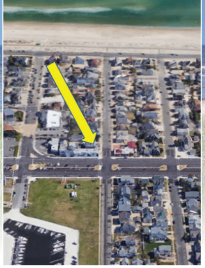
Property Address: 66 I Street, Seaside Park, NJ 08752