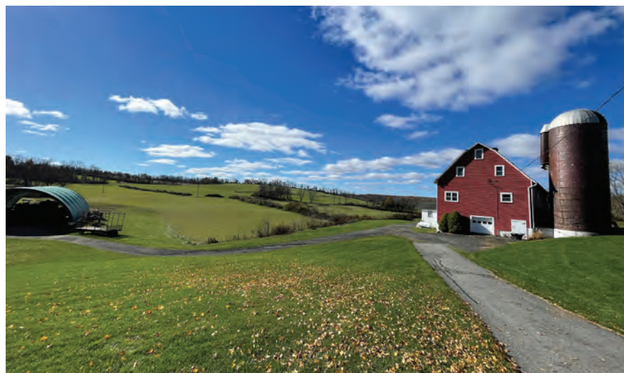
Farm operation ready to go