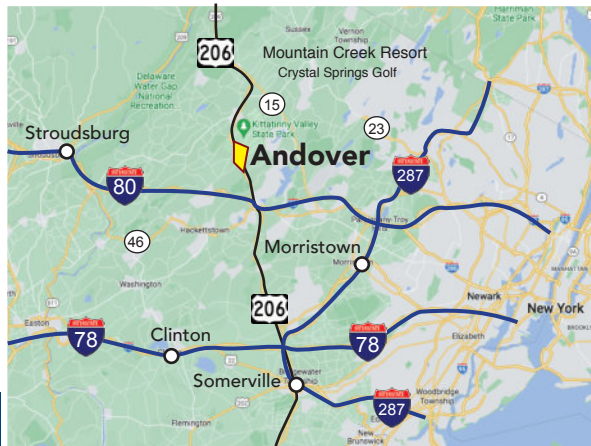
Andover, Sussex County, NJ

Online Auction Bidding Concludes Thursday, March 9, 2023 at 11 am