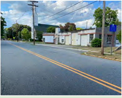
400 Greenwich Street & 312 Fourth Street, Belvidere Warren County, NJ 07823