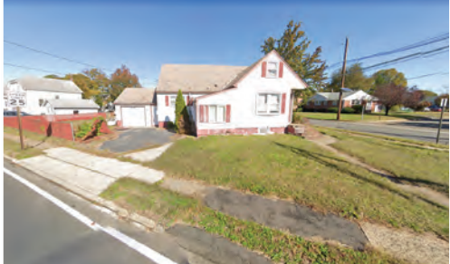
680 Wood Street, Burlington, Burlington County, NJ 08016