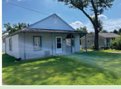
311 Pine Street, Turnersville (Township of Washington) Gloucester County, NJ 08012