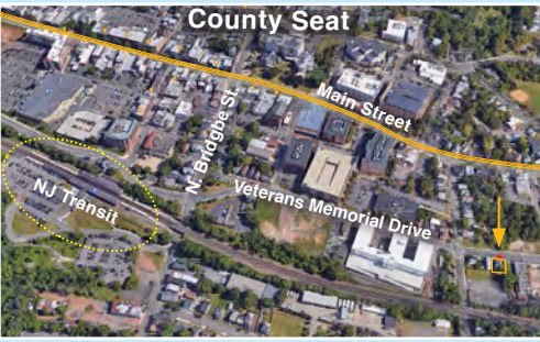
106 Veterans Memorial Drive East, Somerville Somerset County, NJ 08876