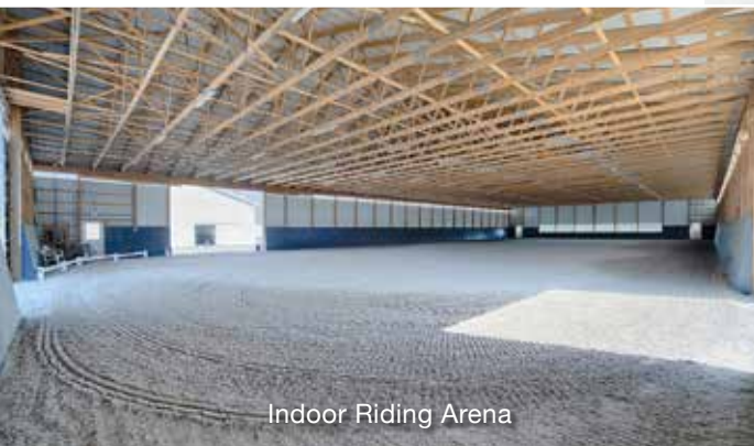
Indoor Riding Arena