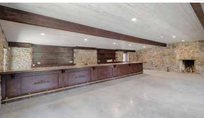
Wine Tasting Stone Barn with Bar & Fireplace

61 Old Turnpike Rd, Washington Township, Morris County, NJ 07853