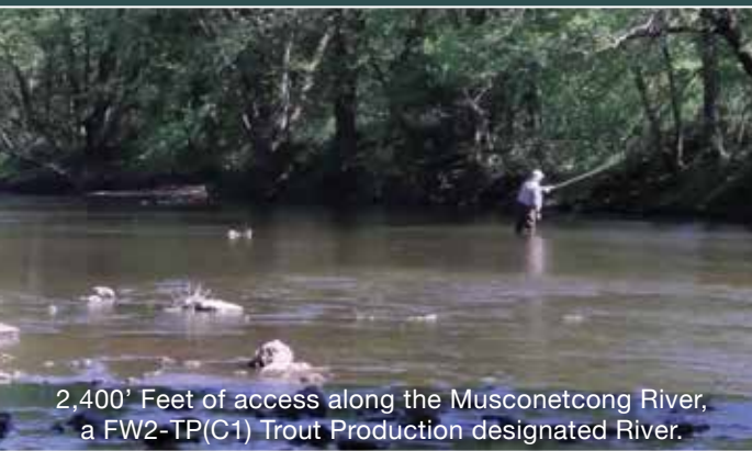
2,400' Feet of access along the Musconetcong River, a FW2-TP(C1) Trout Production designated River.

Property Previews 12-2 pm: Tuesday, May 24 th Sunday, June 5 th