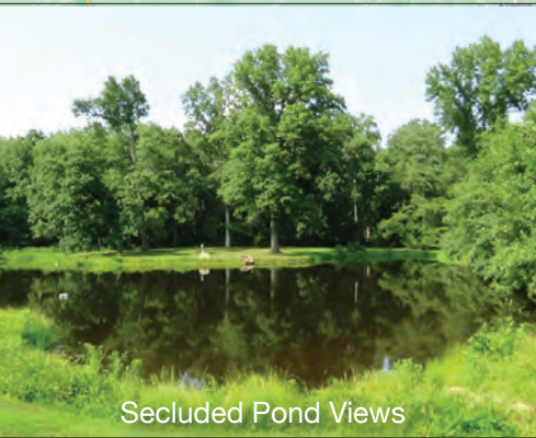
Secluded Pond Views