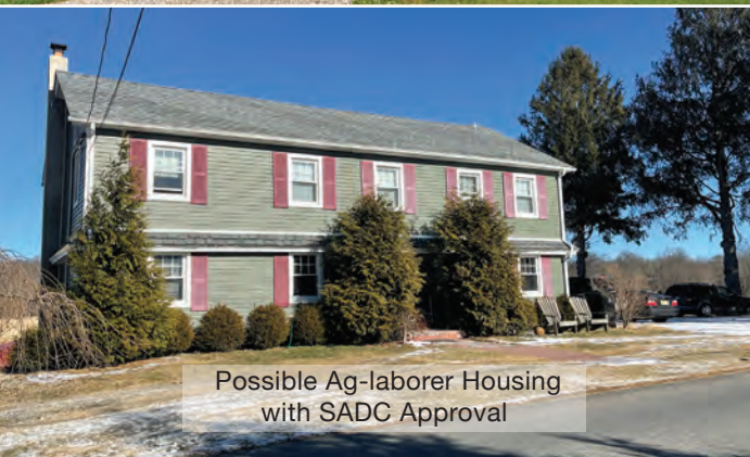
Possible Ag-laborer Housing with SADC Approval