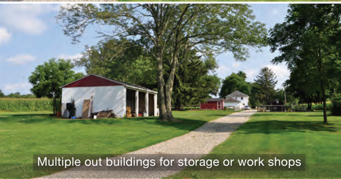
Multiple out buildings for storage or work shops