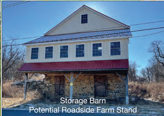
Storage Barn Potential Roadside Farm Stand