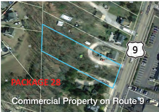
Commercial Property on Route 9

SOLD SEPARATELY AND IN PACKAGES Visit maxspann.com for a complete list of properties, a detailed Property Information Package and to learn how to bid.