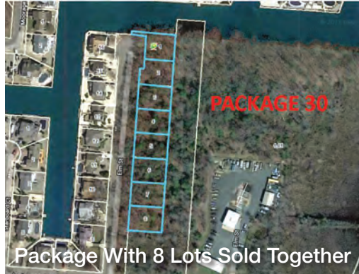
Package With 8 Lots Sold Together

A list and Google map of the property locations are available on maxspann.com