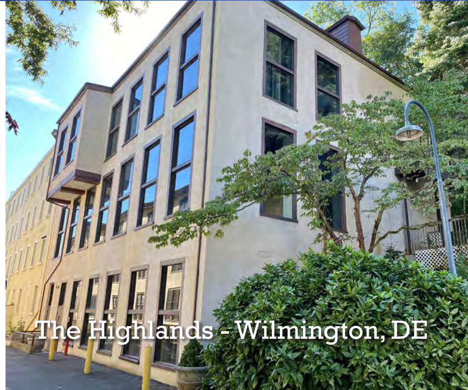
The Highlands - Wilmington, DE