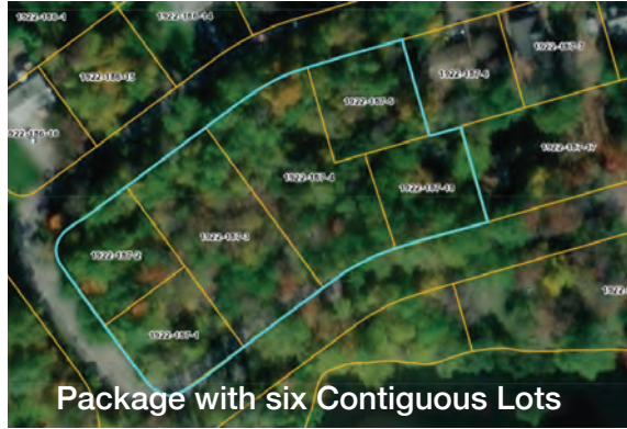
Package with six Contiguous Lots

Select your Favorites and Bid Your Price!