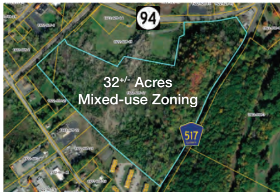
32+/- Acres Mixed-use Zoning