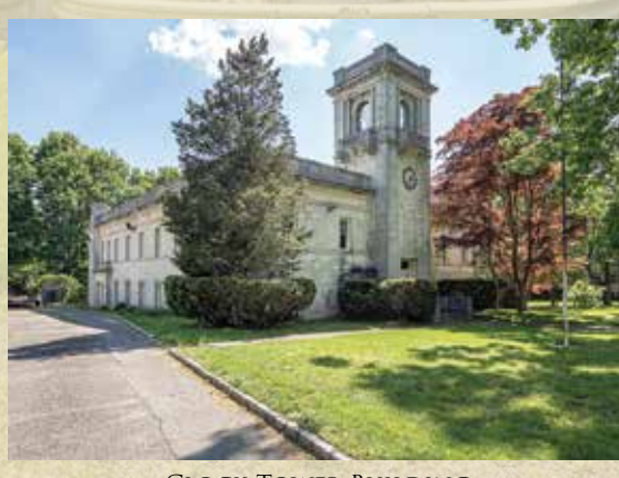
CLOCK TOWER BUILDING Ample Room for the Car Collector! 15,000<sup>+/-</sup> sf Garage Capacity for 11<sup>+/-</sup> Cars