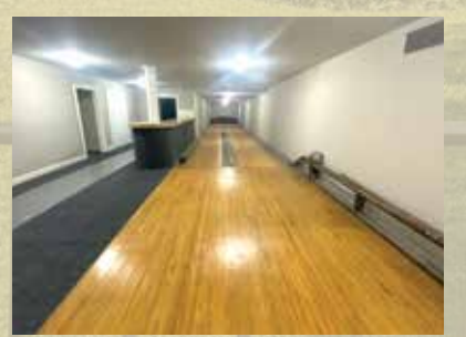
INDOOR BOWLING ALLEY