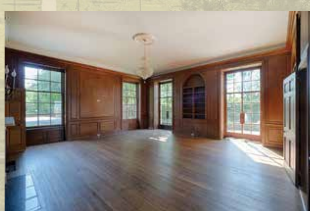
WOOD PANELED LIBRARY

Online Auction Concludes Wednesday, July 14, 2021 at 11 am