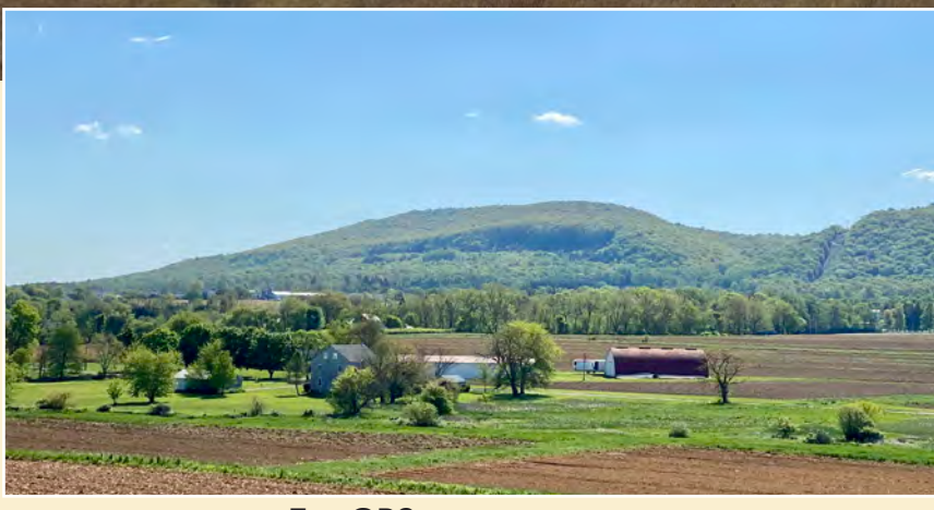
For GPS purposes use: 62 E. Bethany Road, Millcreek, Lebanon County, PA 17073 (Property is across the street.)