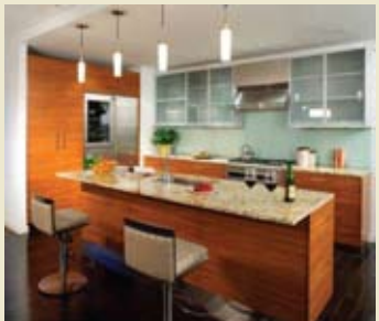
Wide Open Spaces Great for Entertaining

Properties will be sold through Bidder's Choice. (In each round of bidding, the winning bidder chooses their favorite property from the remaining inventory.) The first Penthouse and first three condominiums will be guaranteed to be sold at the minimum bid or higher, subsequent units will be subject to seller's confirmation.