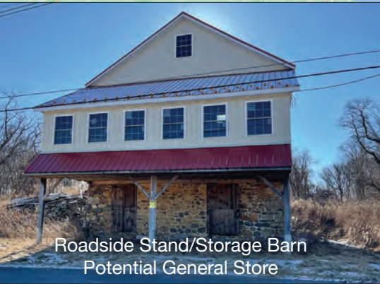
Roadside Stand/Storage Barn Potential General Store