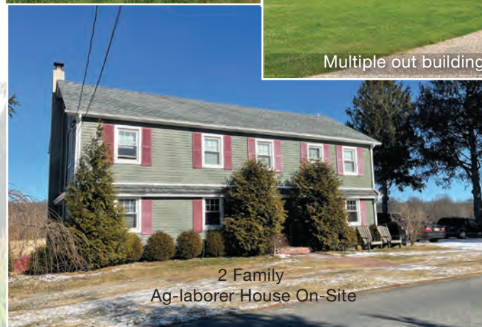
2 Family Ag-laborer House On-Site