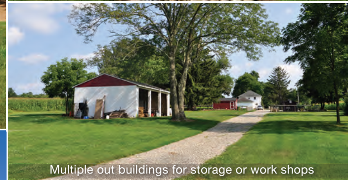
Multiple out buildings for storage or work shops