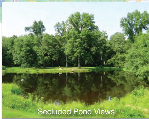
Secluded Pond Views