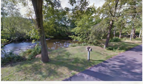
Crystal Clear Trout Stream