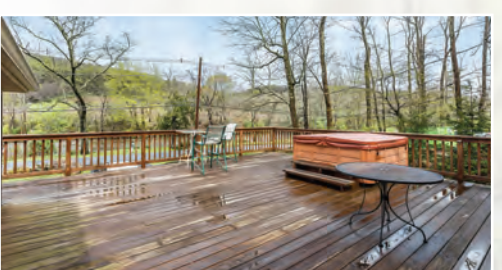
River and Country Views from your Deck