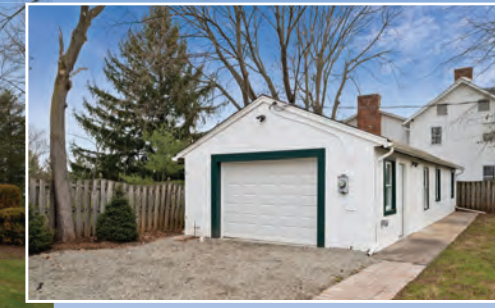
Workshop #2 18'x48'