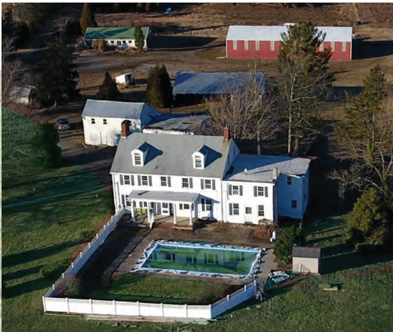
Pre-1800 Colonial Home with Six Bedrooms and Pool