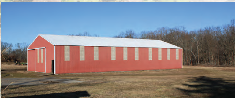
4,200 ± sq ft Barn with 14' Doors

888-299-1438 MAXSPANN.COM SERVING THE NATION