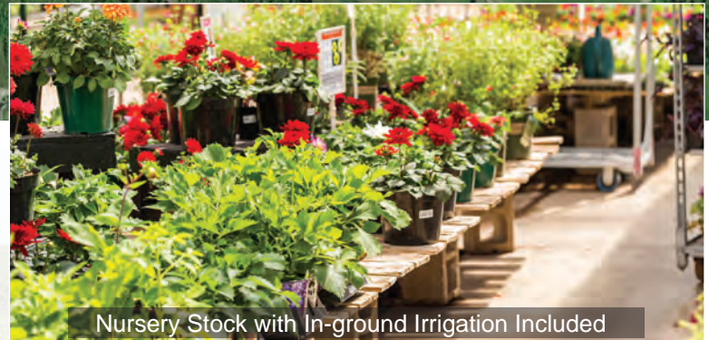
Nursery Stock with In-ground Irrigation Included

49 Holmes Mill Road Upper Freehold Township (Cream Ridge) Monmouth County, NJ 08514