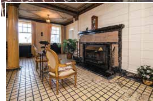
Hand Crafted Fireplaces