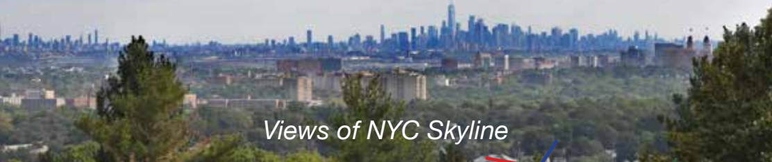
Views of NYC Skyline

THE WORLD LAYS AT YOUR FRONT DOOR SOUTH ORANGE, NJ