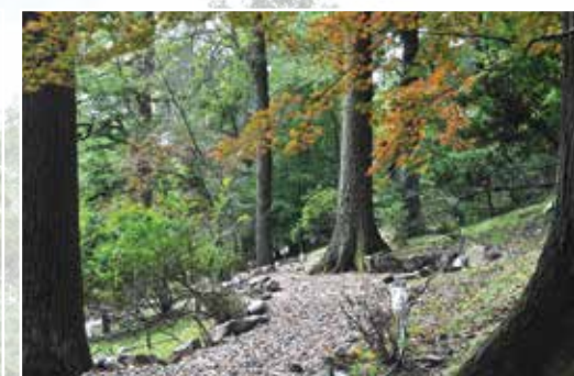
2 + Acres with Tranquil Walking Paths