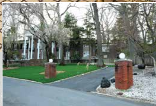
Circular Drive Entrance