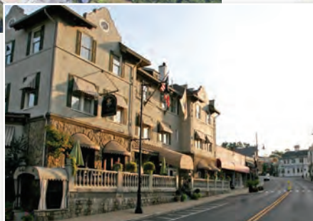
Direct Train to NYC or enjoy dining & shopping in downtown historic Bernardsville

888-299-1438 MAXSPANN.COM SERVING THE NATION