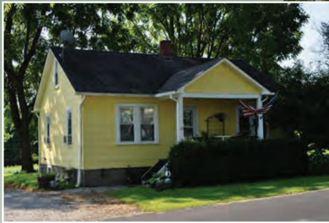
Cozy Cottage House