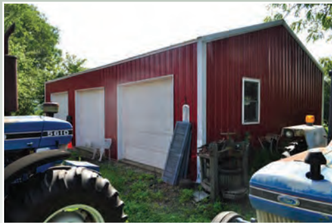
Newer Pole Barn for Equipment

READY TO FARM! BRING YOUR TRACTOR AND BE READY FOR THE NEW SEASON