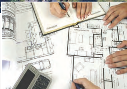
Build your dream estate