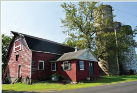
Former Dairy Barn