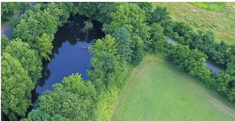
Fish, boat, and skate