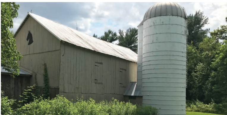
Multi-purpose storage barn