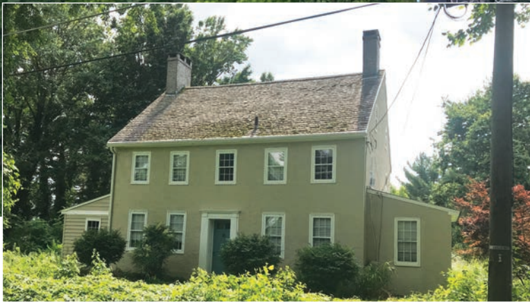
Raise your family on this incredible farmstead

1309 Jacksonville Road Columbus (Mansfield Twp), Burlington County, NJ 08022