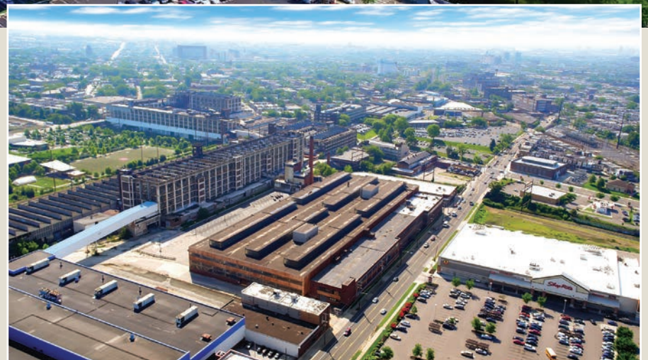
“Live. Work. Play.” Redevelopment Opportunity

The properties are being sold in five separate parcels and are well-suited for a “Live, Work, Play” mixed-use development. The buildings include a mix of industrial, distribution and warehouse with high ceiling heights and rail and tractor trailer access. Other buildings are ideal for retail and residential with courtyard floorplans, large windows and close proximity to shopping, transportation and Temple Health.