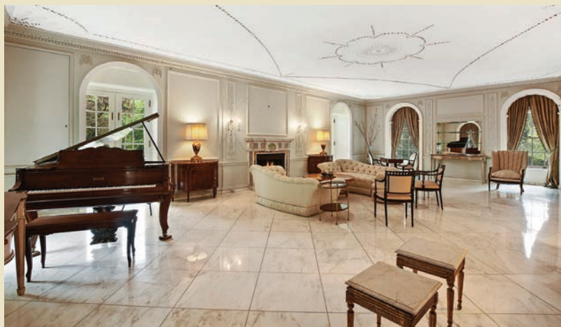
SUN DRENCHED LIVING ROOM WITH FRENCH DOORS LEADING TO THE PATIO AND WONDERFUL GROUNDS