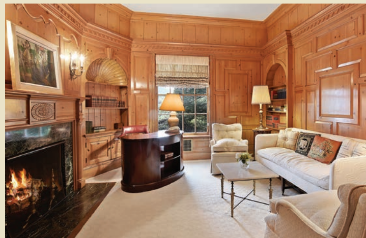
TASTEFULLY APPOINTED LIBRARY WITH ARTISAN ACCENTS