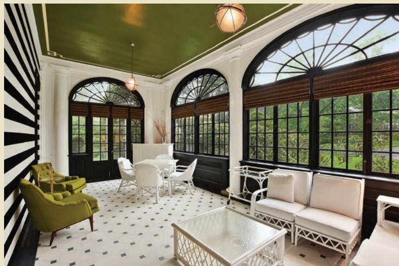
THE CONSERVATORY IS THE PERFECT LOCATION FOR THE SUNDAY MORNING BRUNCH OR MONTHLY BOOK CLUB MEETING