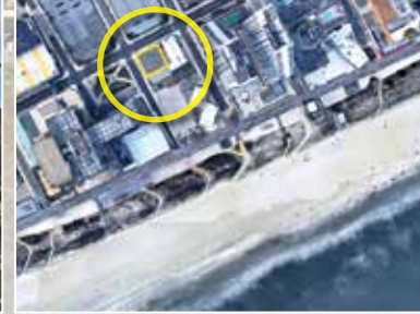
Close to the beach