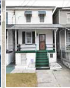
Ready to rent