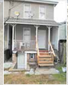
Ready to renovate