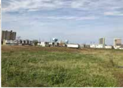
Large land parcels