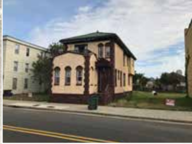
Lots & residences