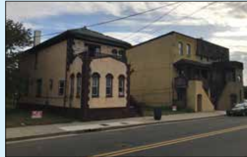
Contiguous Multi Family