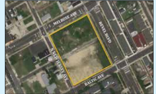
Entire City Block with Dense Zoning