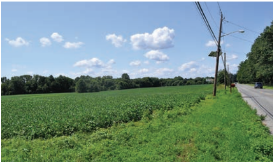
Farm Market Location on Old York Rd