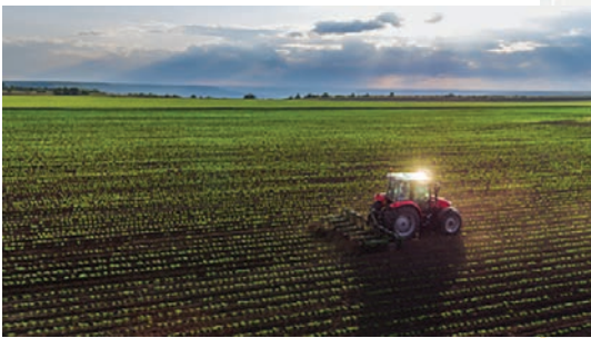
A Great Time to Invest in Land!