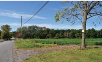
2,170+/- Feet Along Charming Country Lane