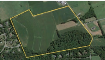
Perfect Balance of Fields & Forest

AUCTION LOCATION: ALEXANDRIA TOWNSHIP TOWN HALL 242 LITTLE YORK MT PLEASANT RD MILFORD, NEW JERSEY 08848