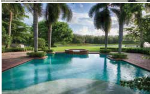
Spacious Backyard to Relax in the Sun and Take in the Beautiful Nature Views