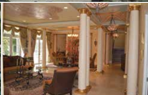
Great Room for Entertaining with French Doors Leading Guests to the Pool and Expansive Patio