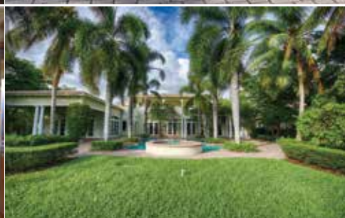
Your Private Backyard Oasis