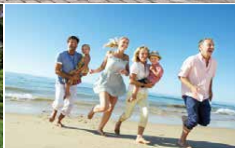
Enjoy The Carefree Florida Lifestyle

PROPERTY PREVIEWS 12 TO 2 PM: SATURDAY & SUNDAY, NOVEMBER 11 TH & 12 TH SATURDAY & SUNDAY, NOVEMBER 18 TH & 19 TH