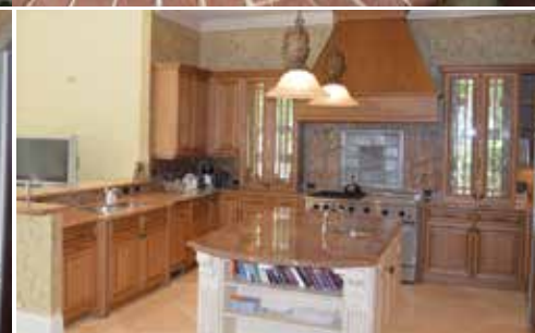
Gourmet Kitchen with Granite Counter Tops, Butlers Pantry with Wet Bar and Wine Chiller