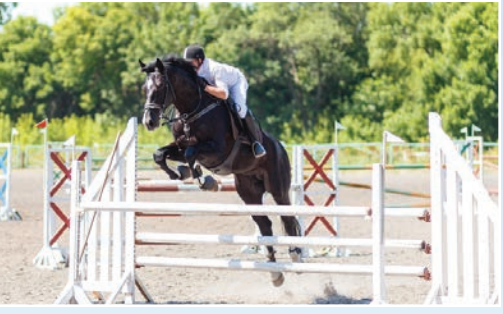
Train Champions and Host Events