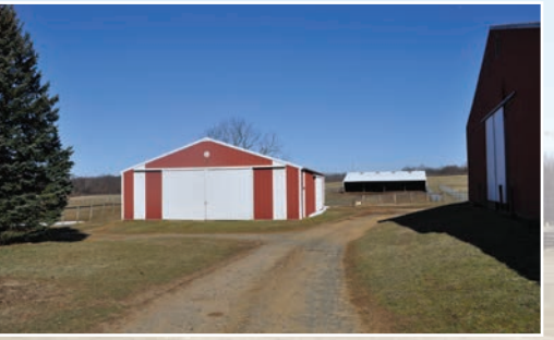
Several Barns On-Site for All Your Equipment Needs