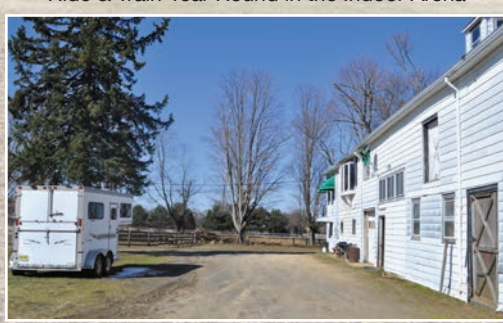
38 Stall Barn with Ample Hay Storage and Apartment on Second Floor