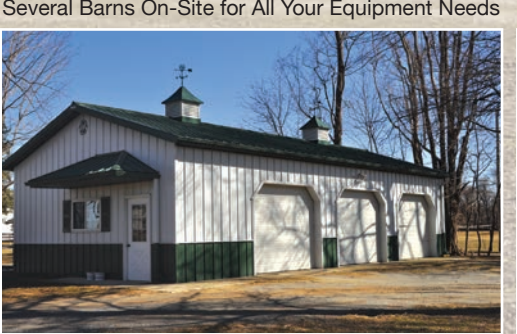
Store Your Vintage Cars or Your Daily Ride

NEW YORK: 252 West 37th Street, Suite 200E, New York, NY 10018 NEW JERSEY: Clinton, New Jersey 08809