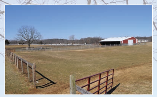
Room for All! 8 Paddocks with Water System