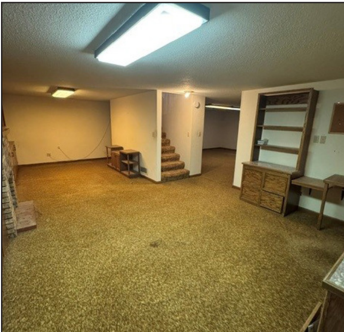
Main Room of Basement