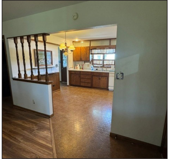
Kitchen View from the Dining Room