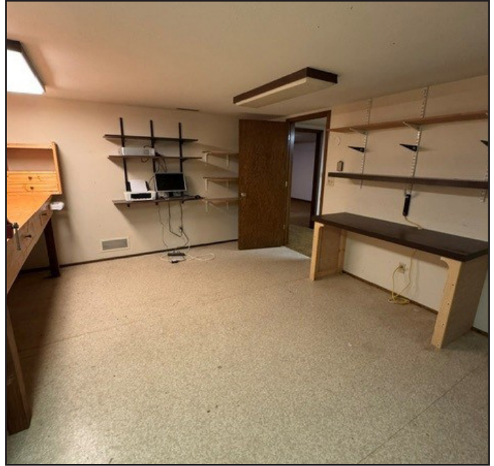
Basement Work Room