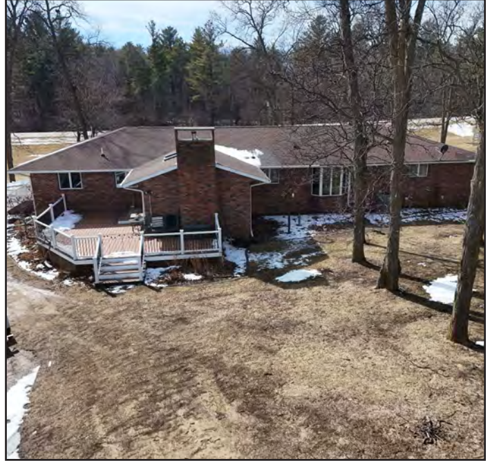
Northeast Side of House