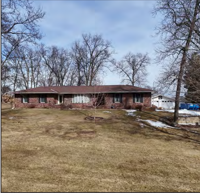
Southwest Side of House