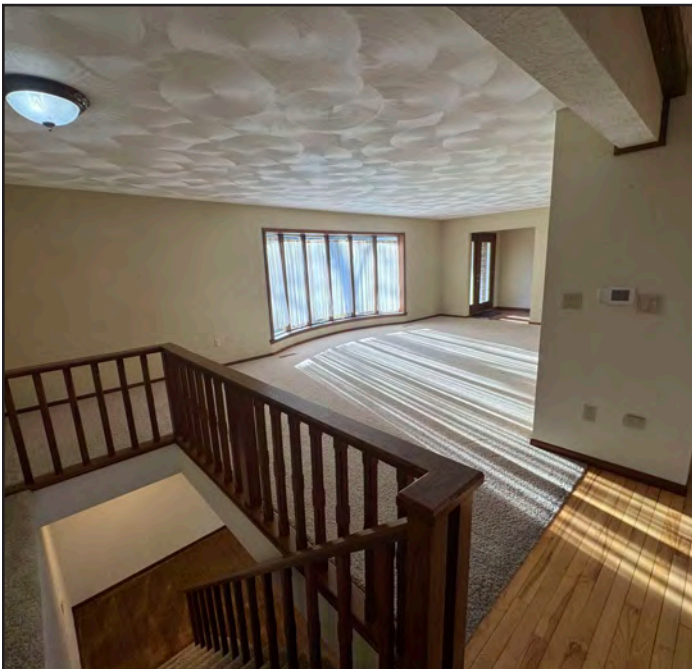
Formal Living Room