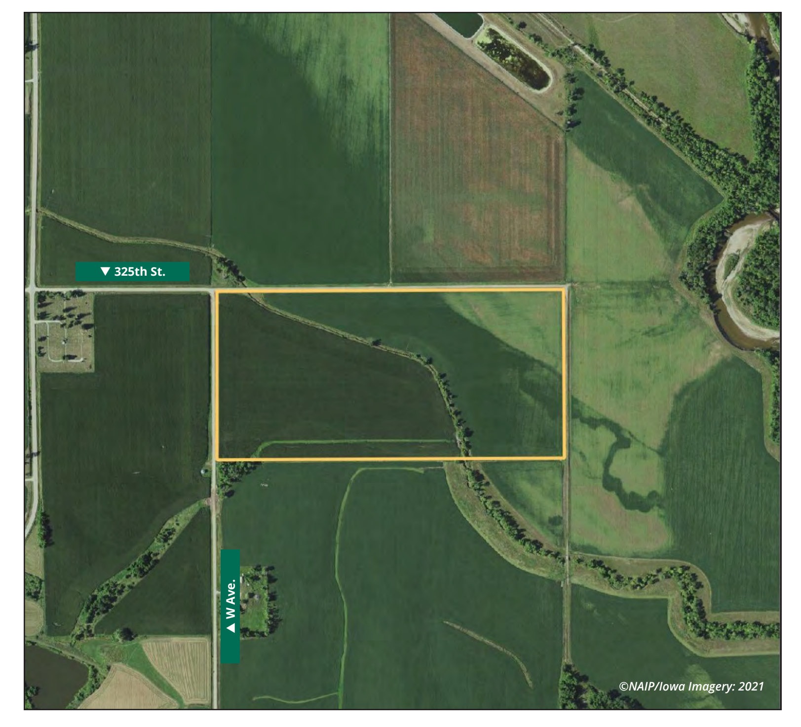
FSA/Eff. Crop Acres: 71.95 | Soil Productivity: 85.90 CSR2

515.382.1500 | 415 S. 11th St. | Nevada, IA 50201 | www.Hertz.ag