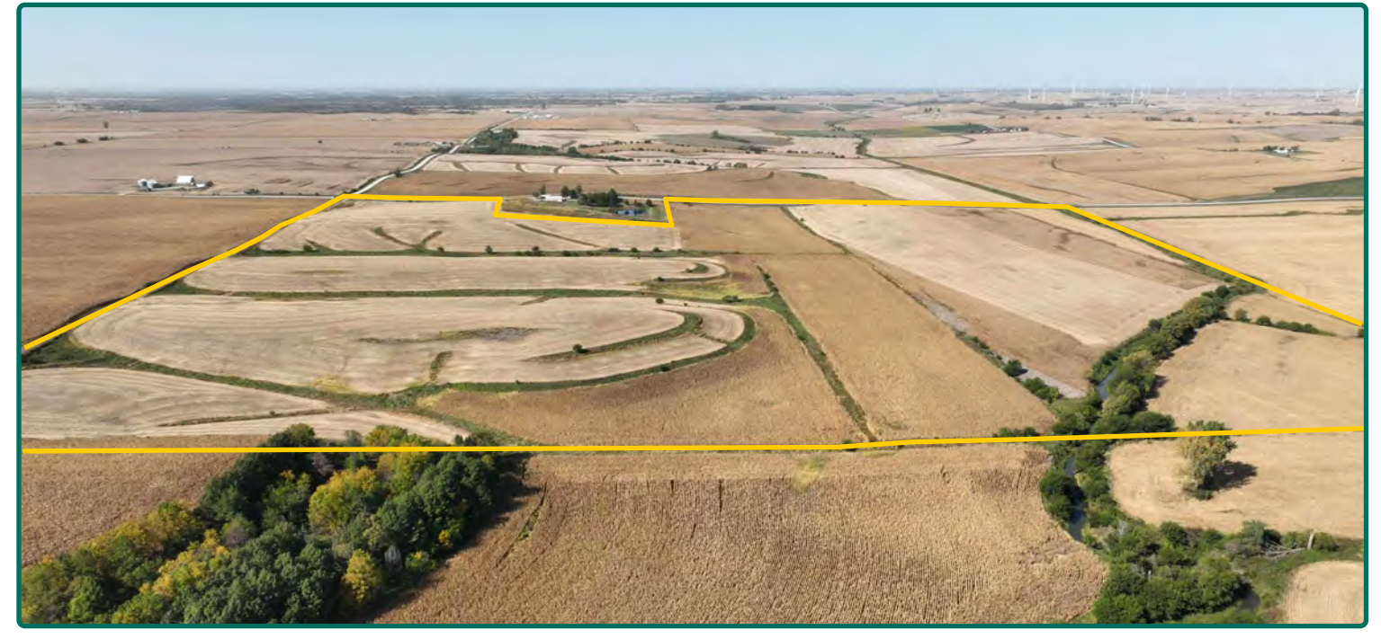
Northeast Corner Looking Southwest