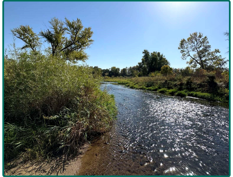
Northeast Corner Looking Southwest