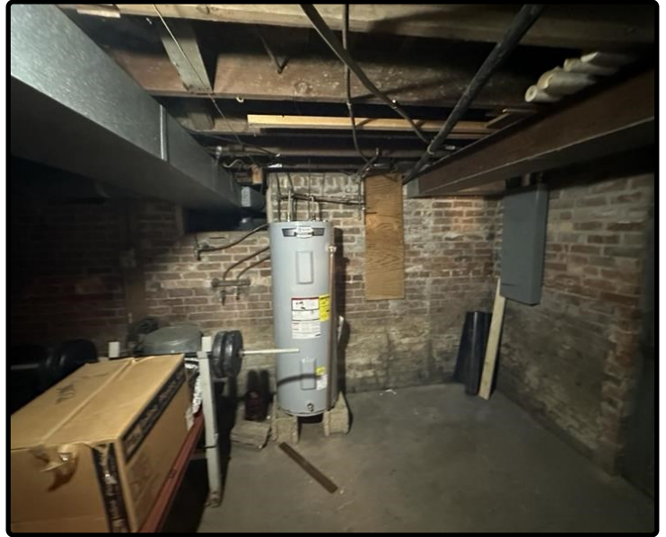
Parcel 9 - Water Heater