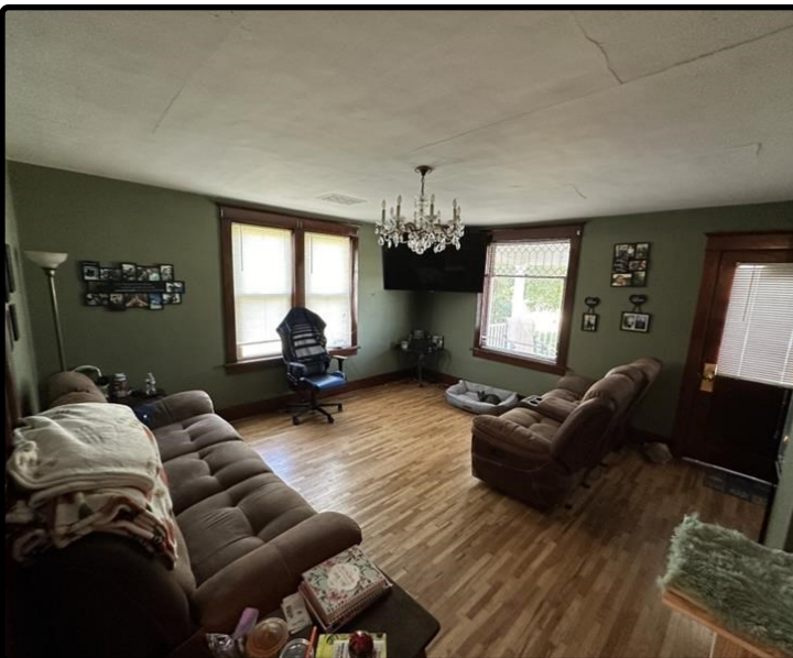
Parcel 9 - Living Room