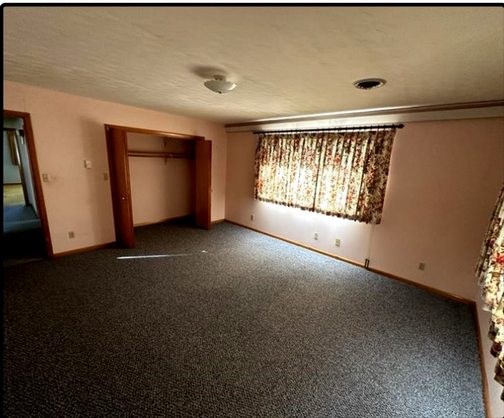
Parcel 8 - Bedroom 3