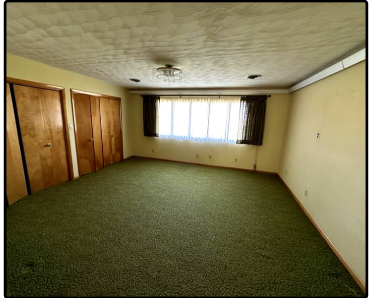
Parcel 8 - Bedroom 2