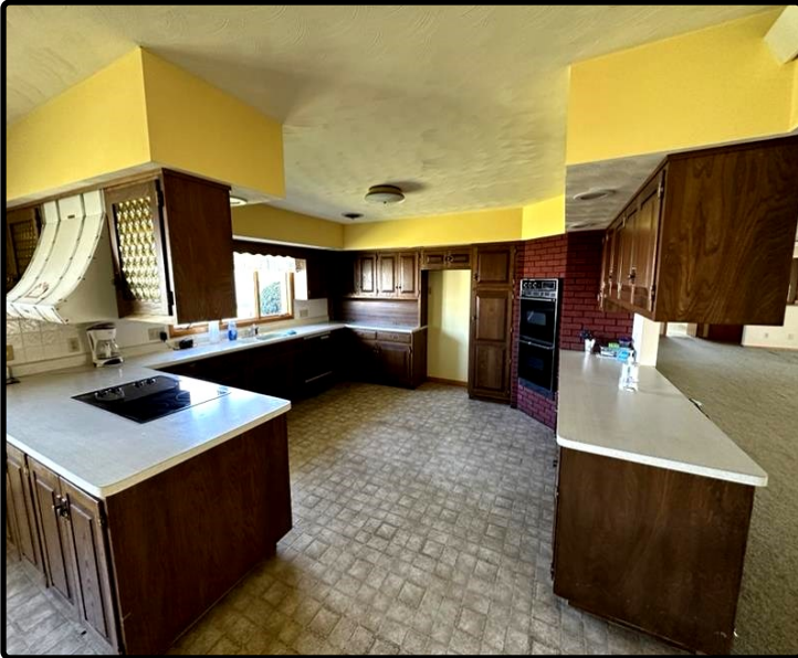
Parcel 8 - Kitchen