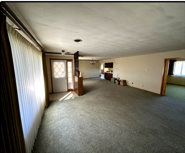
Parcel 8 - Living Room