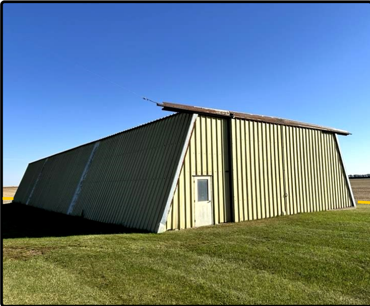
Parcel 8 - Shed