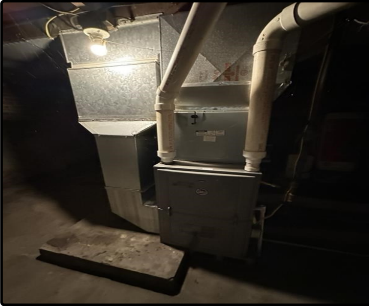
Parcel 9 - Furnace