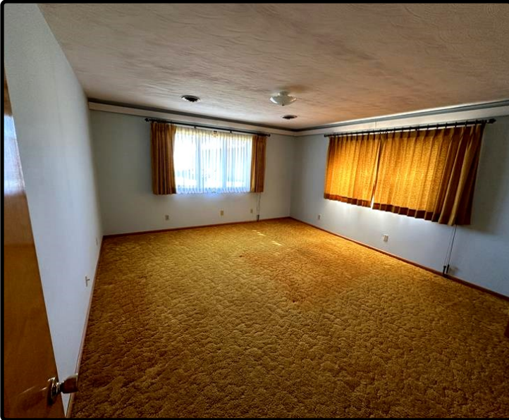
Parcel 8 - Bedroom 1