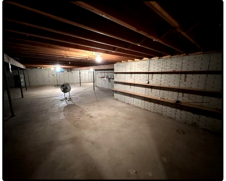
Parcel 8 - View of the Basement