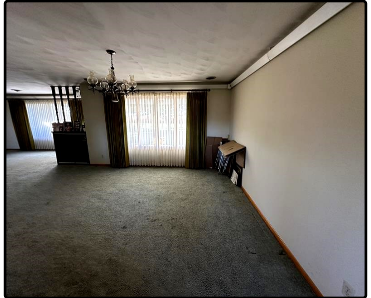
Parcel 8 - Dining Room