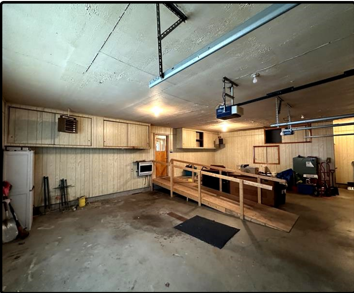
Parcel 8 - Garage