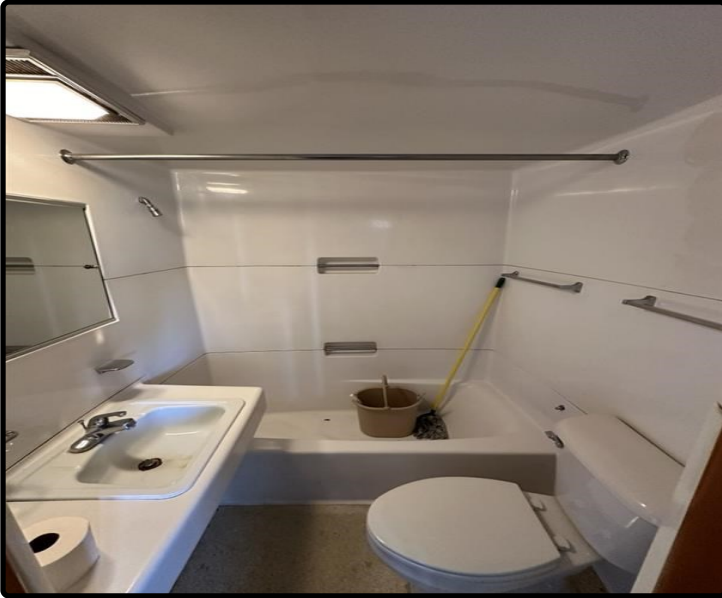
Parcel 8 - Bathroom 2