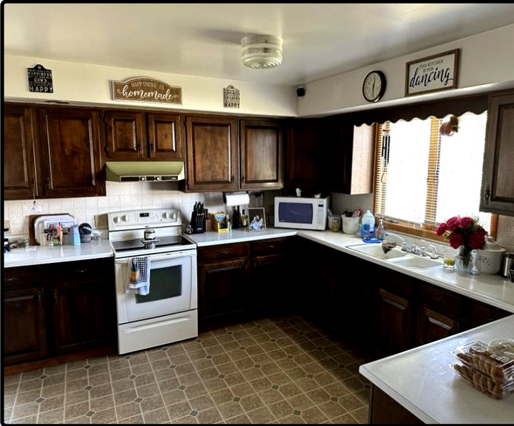
Parcel 9 - Kitchen