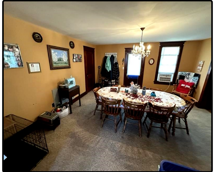
Parcel 9 - Dining Room