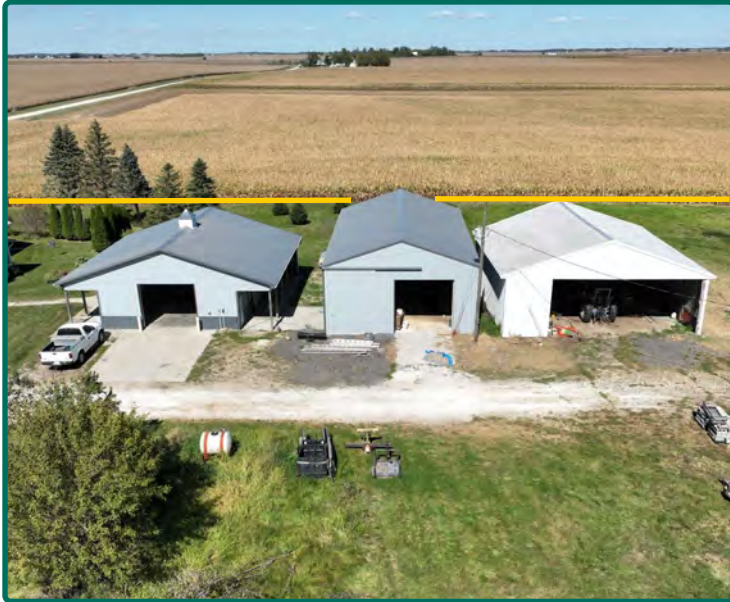
South Looking North