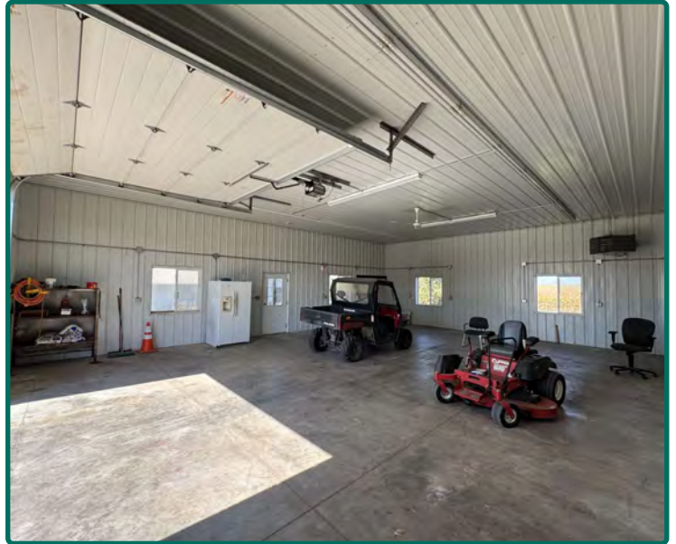
Interior of Shop