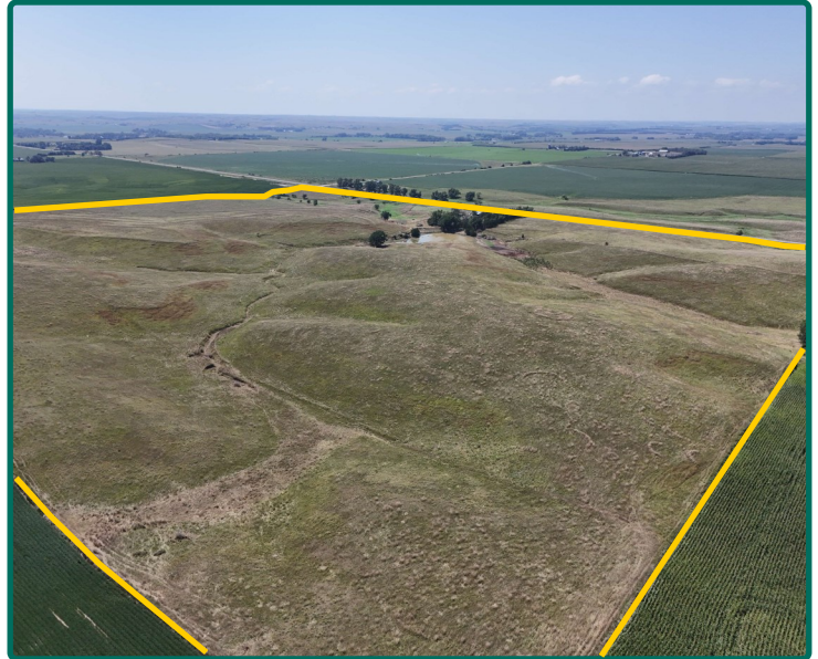
Northeast looking Southwest