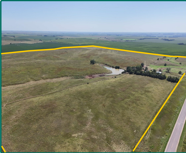
Northwest looking Southeast