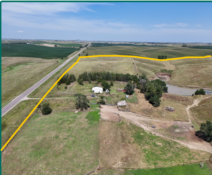
View of the Home Site