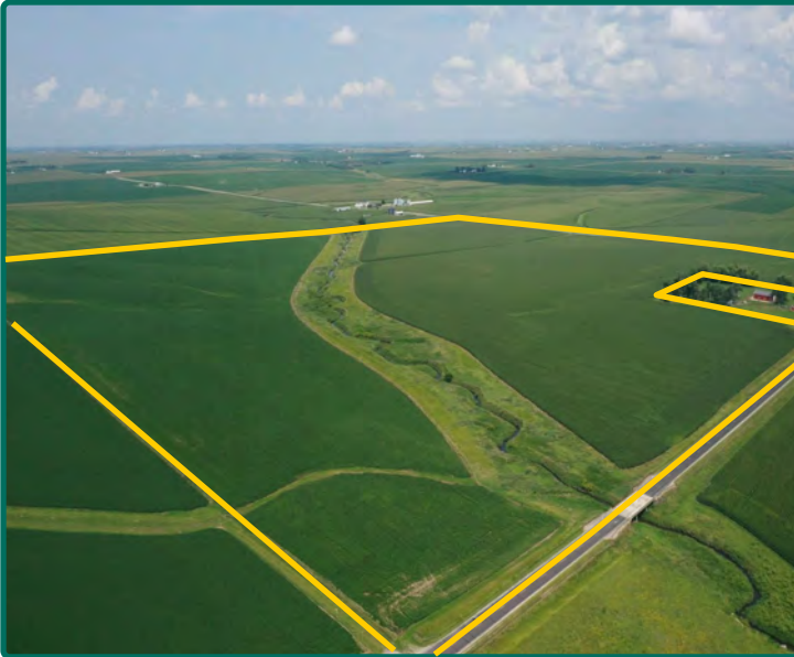
Southwest looking Northeast