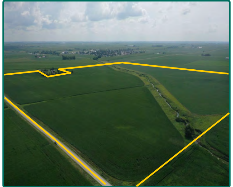
Northeast looking Southwest