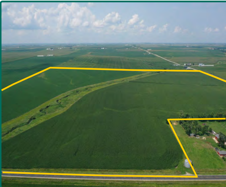
South looking North