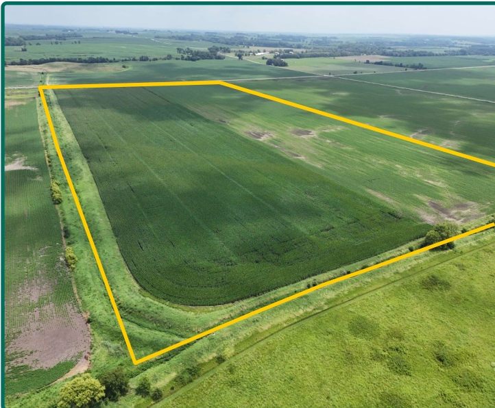
Northwest looking Southeast