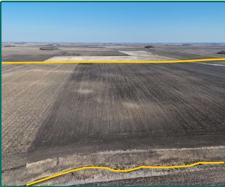
South Looking North