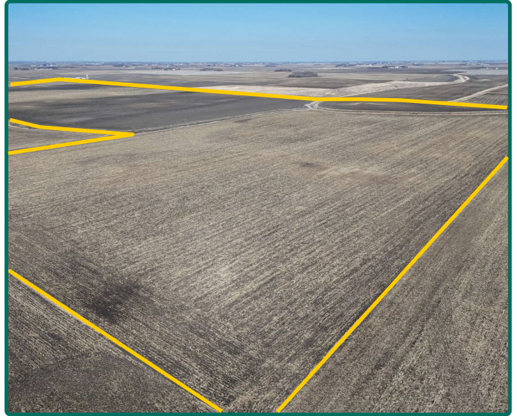
Southeast Looking Northwest