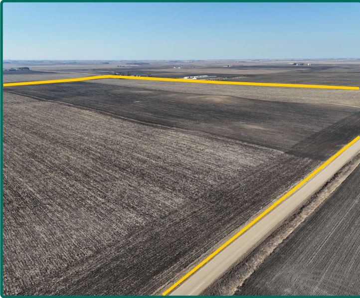
Northeast Looking Southwest