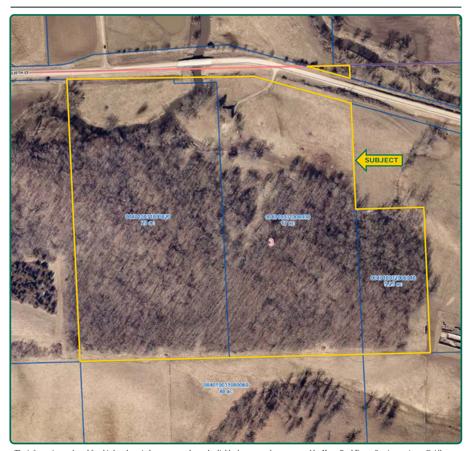
The information gathered for this brochure is from sources deemed reliable, but cannot be guaranteed by Hertz Real Estate Services or its staff. All acres are considered more or less, unless otherwise stated. All property boundaries are approximate.