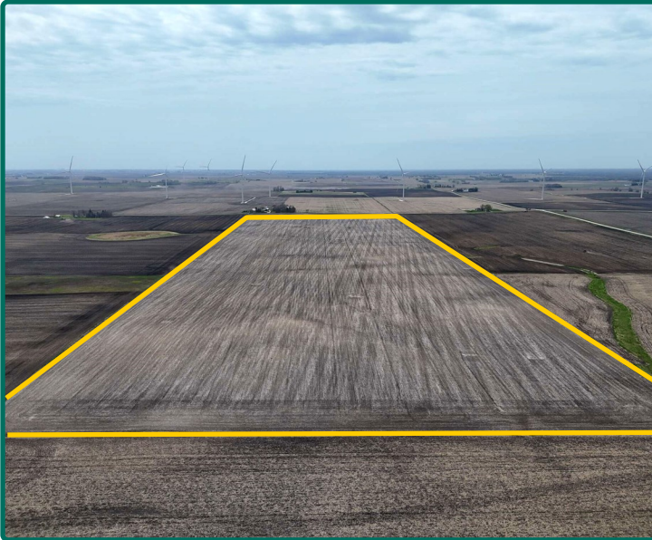
North Looking South