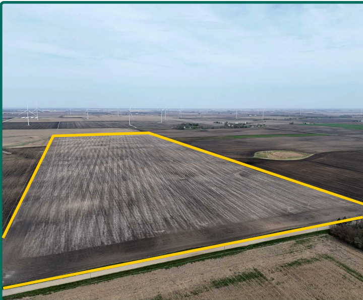
Southwest Looking Northeast