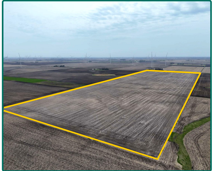
Northwest Looking Southeast