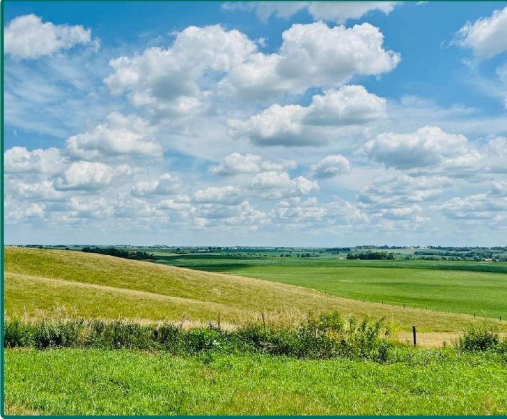
View to the Southeast