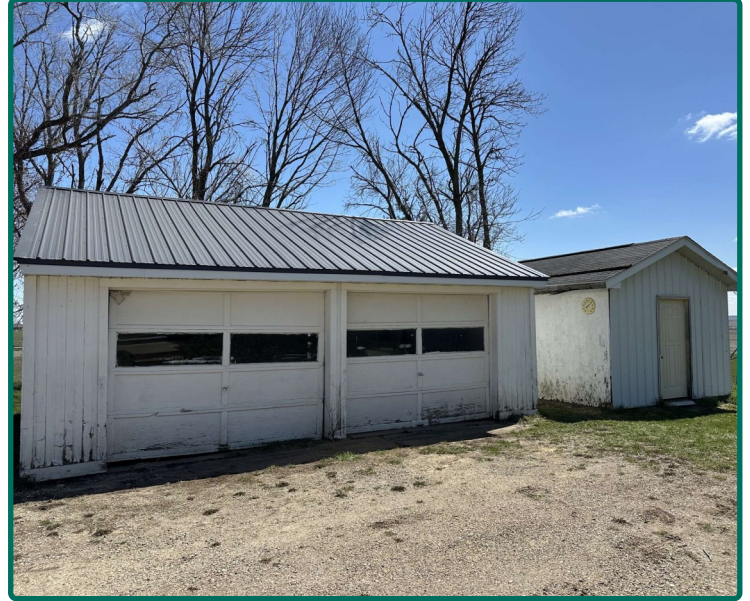
Garage & Shed