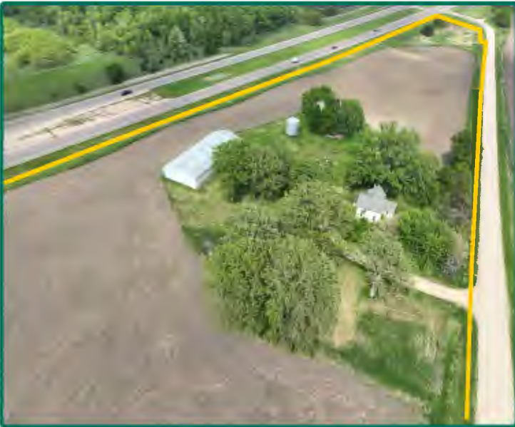
West Side of Building Site