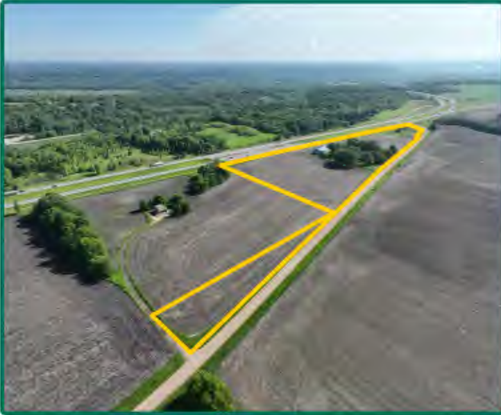
Southwest looking Northeast