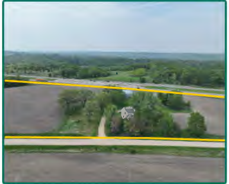
South looking North