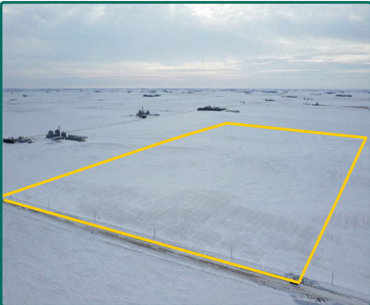
Northwest looking Southeast