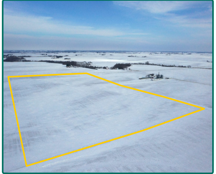
Southwest looking Northeast