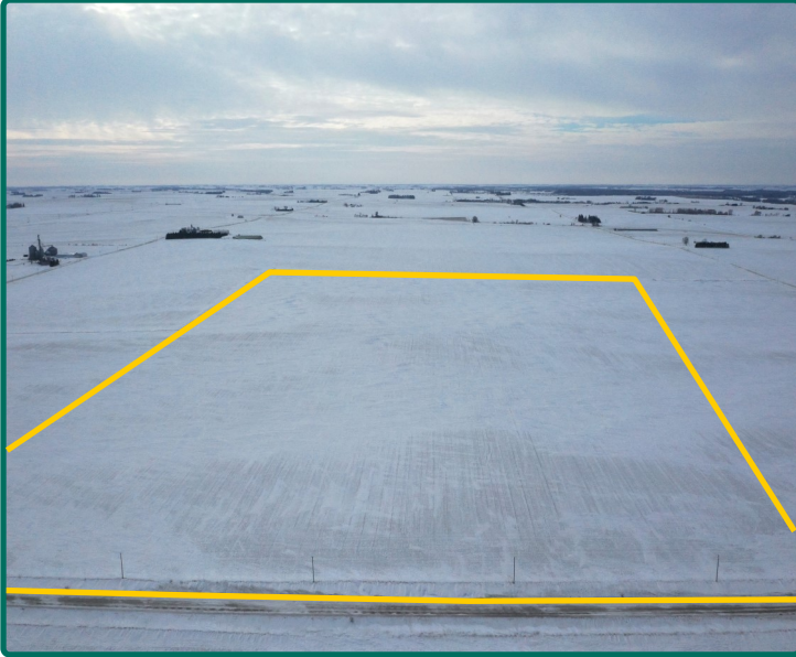
North looking South