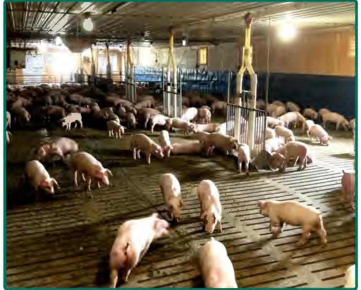
Alley View of Finishing Pens