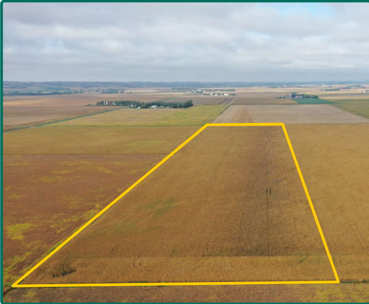
East looking West