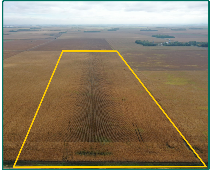
West looking East