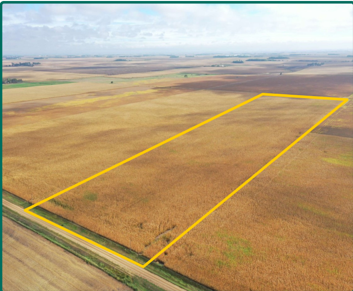
Southwest looking Northeast