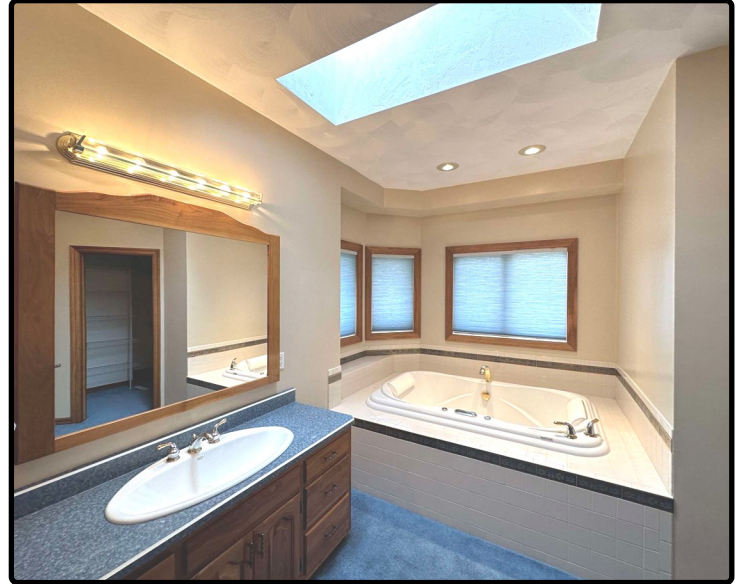
Primary Bedroom Bathroom