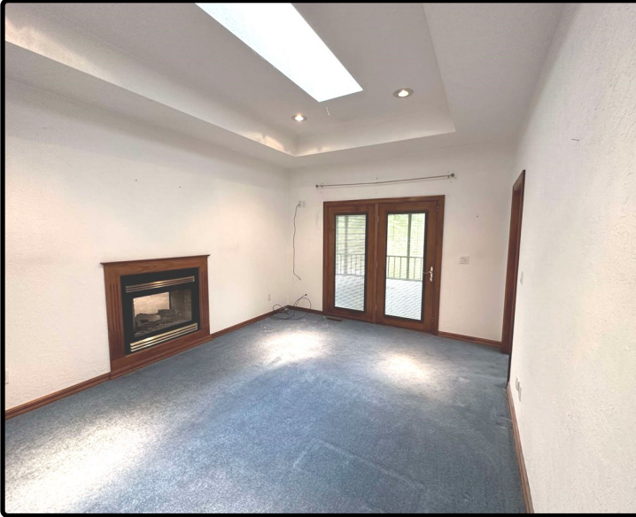
Primary Bedroom Suite