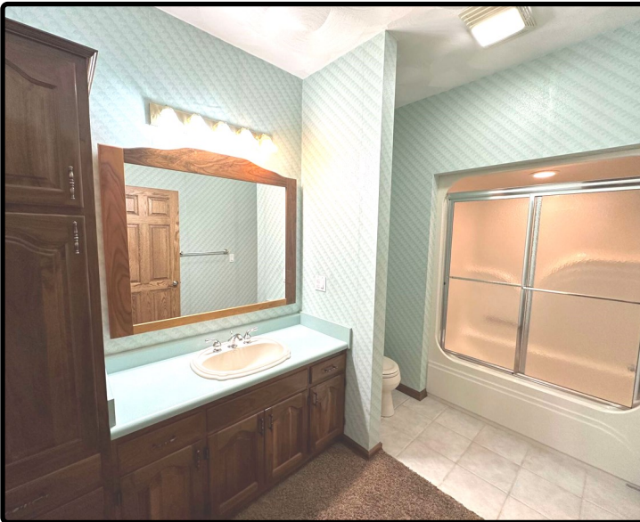
Full Bathroom #2