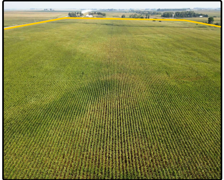
Parcel 7 - 2023 Corn Stand looking N