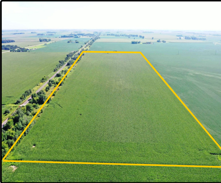
Parcel 9 - 2022 N looking S