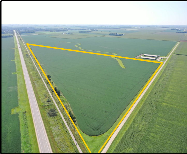
Parcel 5 - 2022 NW Corner looking SE