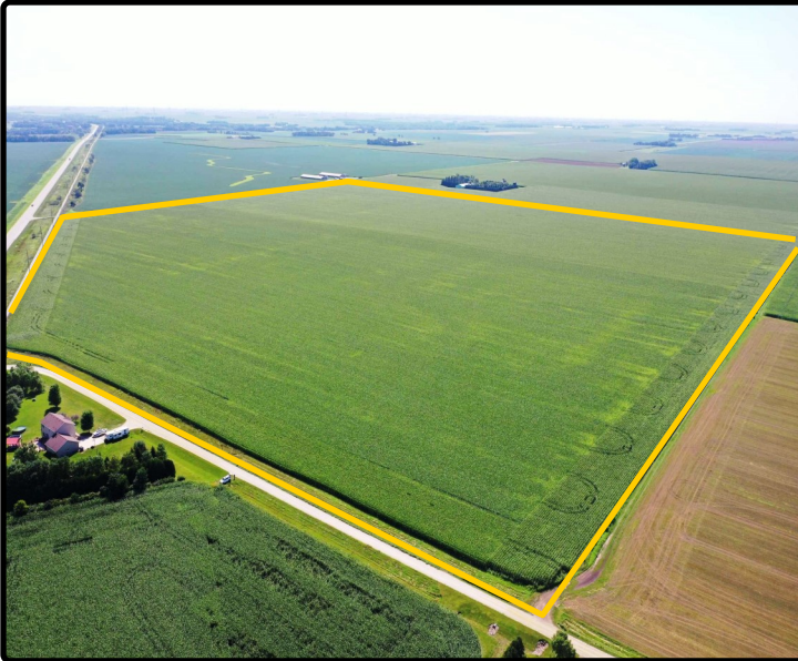
Parcel 3 - 2022 NW Corner looking SE