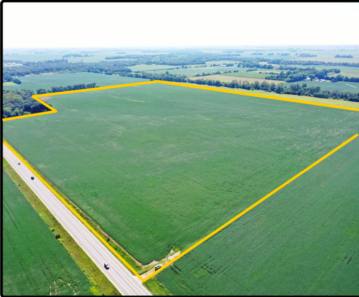
Parcel 8 - 2022 NE Corner looking SW