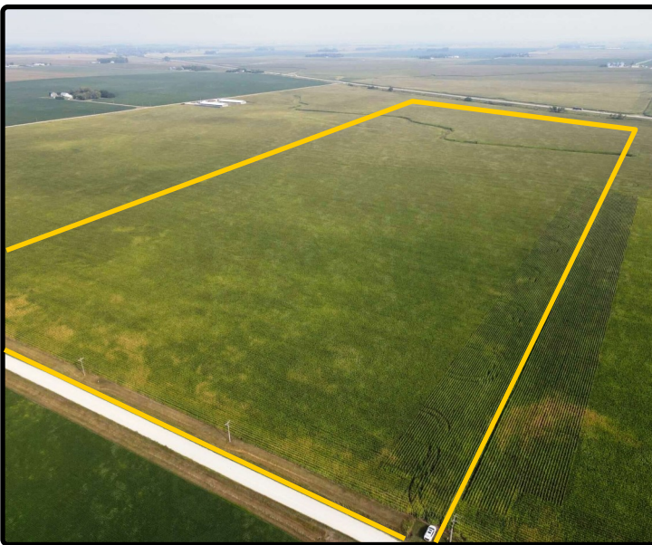
Parcel 4 - 2023 SE Corner looking NW