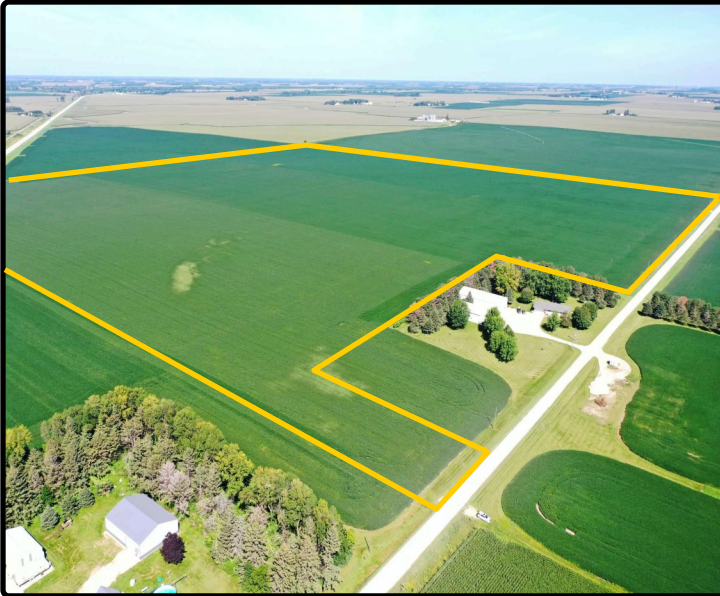
Parcel 6 - 2022 SE Corner looking NW