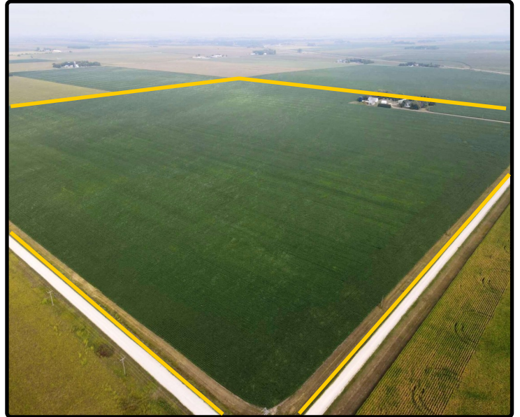
Parcel 2 - 2023 SE Corner looking NW