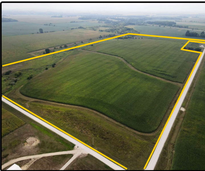
Parcel 7 - 2023 NW Corner looking SE