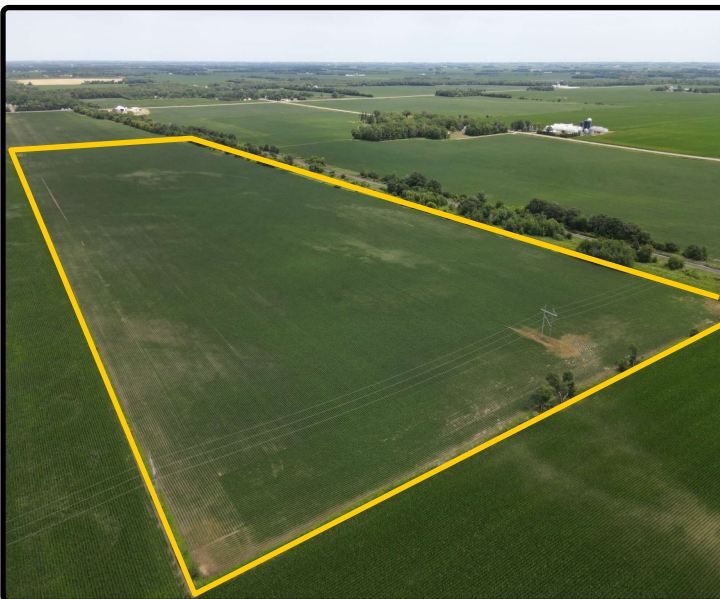
Parcel 9 - 2023 SW Corner looking NE