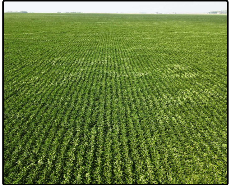
Parcel 3 - 2023 Soybeans looking W