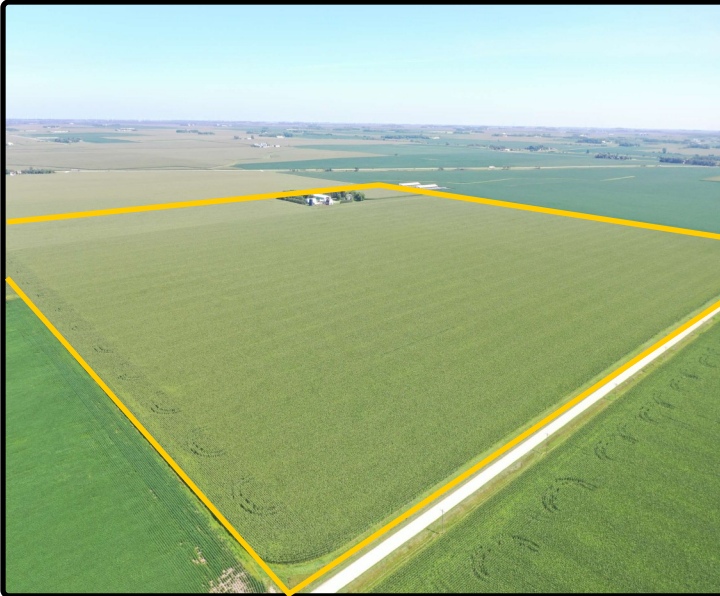
Parcel 2 - 2022 SW Corner looking NE