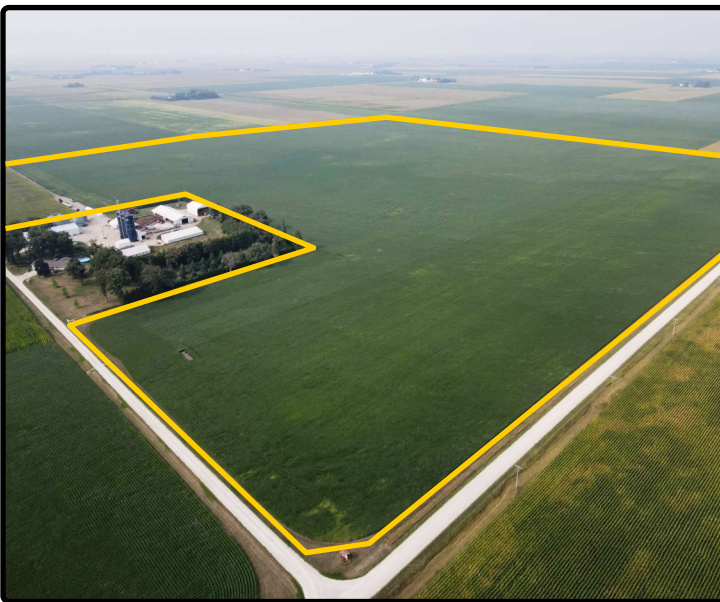
Parcel 1 - 2023 NE Corner looking SW