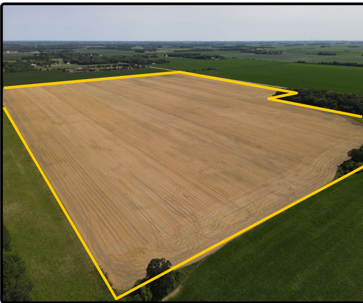
Parcel 8 - 2023 SW Corner looking NE