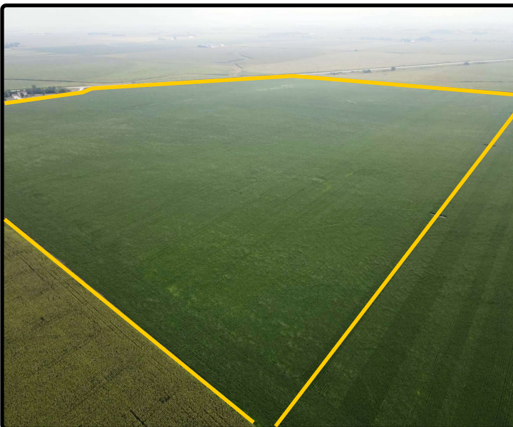
Parcel 3 - 2023 SW Corner looking NE