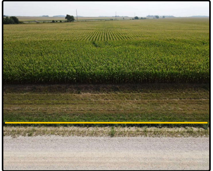
Parcel 5 - 2023 Corn Stand along W end