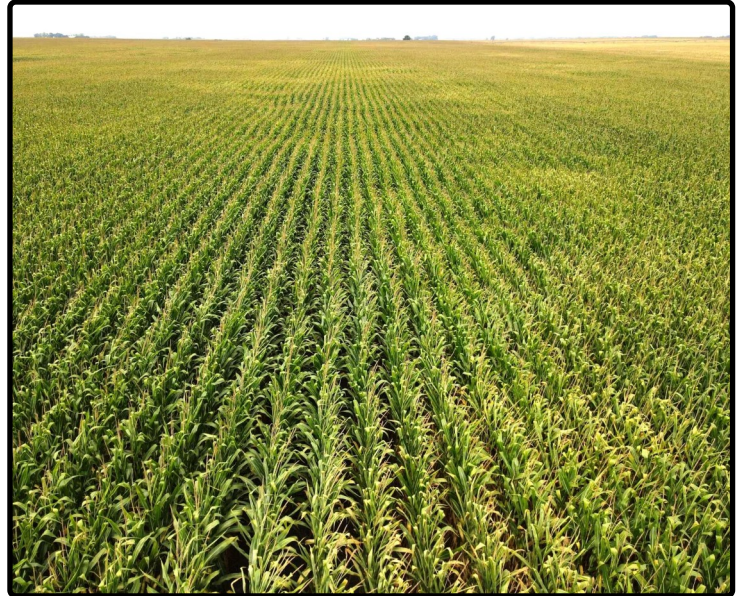
Parcel 6 - 2023 Corn Stand