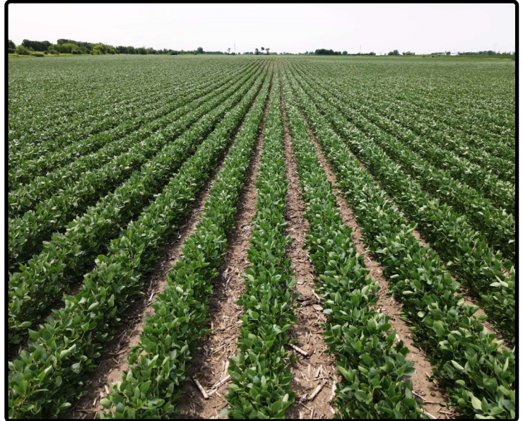
Parcel 9 - 2023 Soybeans looking S