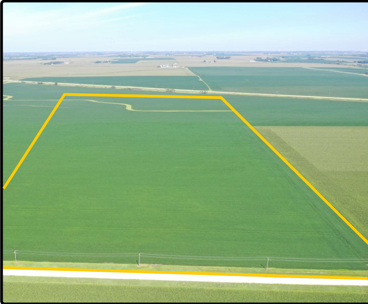
Parcel 4 - 2022 S looking N