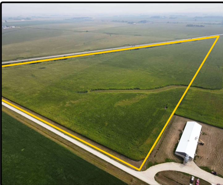
Parcel 5 - 2023 SW Corner looking NE