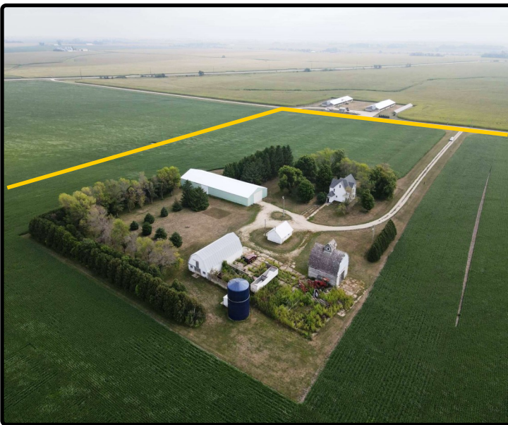
Parcel 2 - 2023 Overlooking Acreage Site