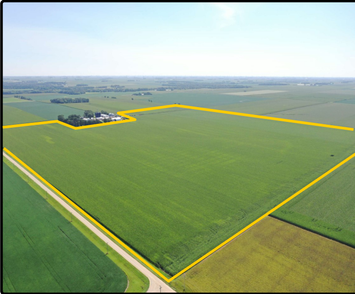
Parcel 1 - 2022 NW Corner looking SE