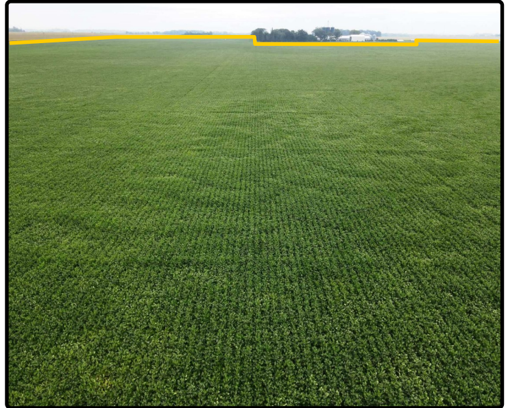
Parcel 1 - 2023 Soybeans looking E