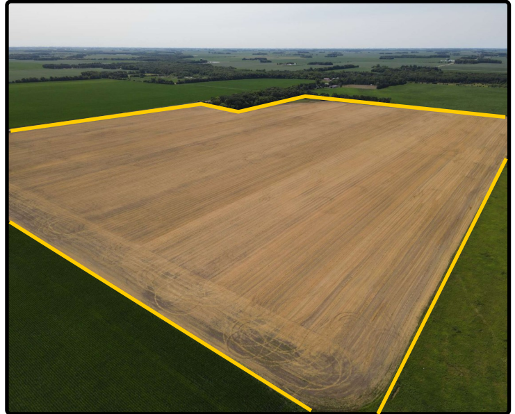
Parcel 8 - 2023 NW Corner looking SE