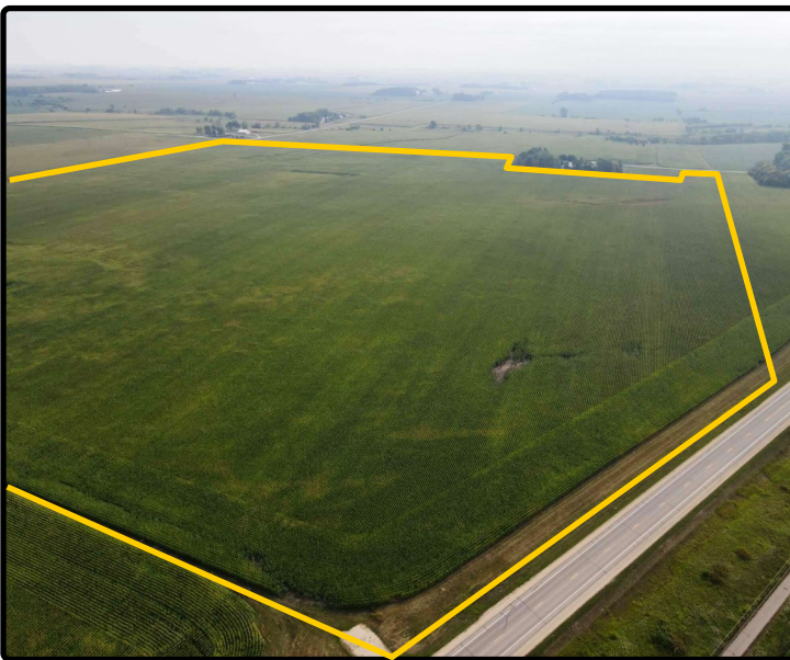
Parcel 6 - 2023 SW Corner looking NE