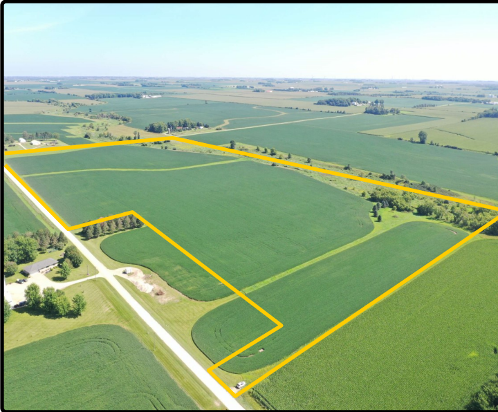
Parcel 7 - 2022 SW Corner looking NE