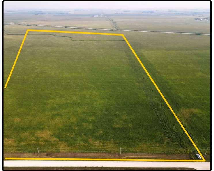
Parcel 4 - 2023 S looking N